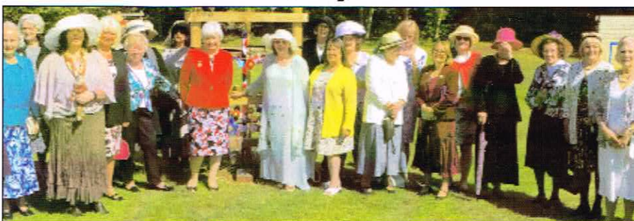
Members of Great Billing WI in their finery for the 100th birthday celebration.