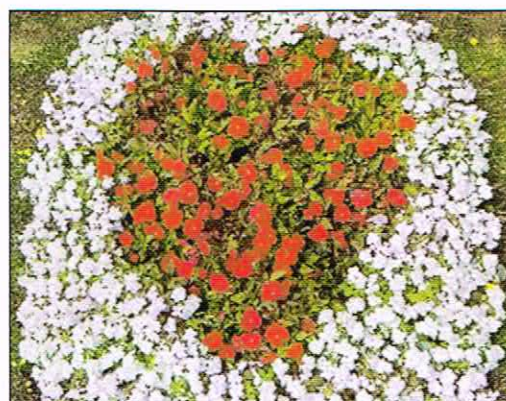
One of the beautiful flower displays' from 'Bellinge in Bloom'

The football pitch at the bottom of the field has been maintained and is now being used by Billing United Football Club for training as well as by many groups of local children. Plans to