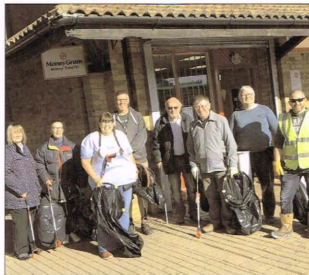
Above: The Ecton Brook litter pickers about to set out on their picks. Below: The collection from the latest pick.

Find us on Facebook - Ecton Brook Residents Group - where all events and more are published.