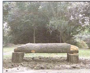
A bench made from the trunk of a fallen tree.

However, with the much-appreciated help from the volunteers that meet on a Wednesday morning, and the contractors involved, we have already made a huge difference to the area.