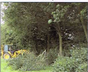
Work in progress in Belling Field.

As you will appreciate this has resulted in vast quantities of green waste and the only feasible, and economic, way for the