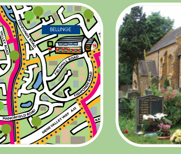
Featuring a brief history of the Billing Parish and a map highlighting two suggested walk routes