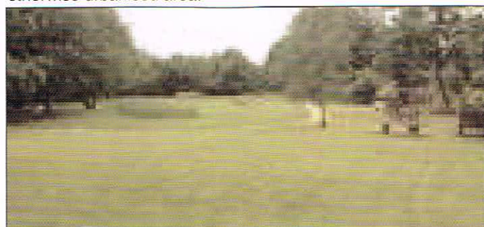
Great Billing Pocket Park.

In 1990 this waste land was acquired by Billing Parish Council and with the help of the County Council Pocket Park scheme, a volunteer management committee was set up to improve the site. The volunteers and contractors, with the help of a grant from the Pocket Park scheme, cleared the area in 1991 and started planting trees to supplement the few remaining from the time when this area was parkland. This created a haven for wildlife in an otherwise urbanised area.