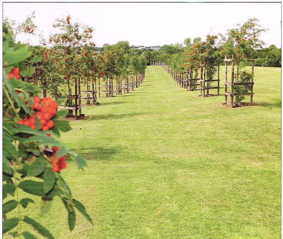
Peter Neve, one of our Little Billing parishioners, kindly took all of the photographs associated with our Heritage Lottery funding. This is just one lovely example - of Celebration Avenue on The Leys.