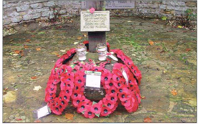
The wreaths laid by the various organisations at Great Billing War Memorial at this year's Remembrance Sunday service.