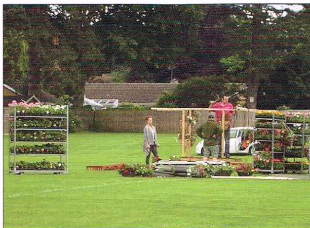
Above and below: stallholders and volunteers transform the sports field in to a one-off market.

We hope to be there again at the end of June in 2017 and hope that many of you will again join us in one way or another. Please get in touch if you have anything to suggest, to offer or to give that will help us to put on another Fayre, maybe even better than those before.