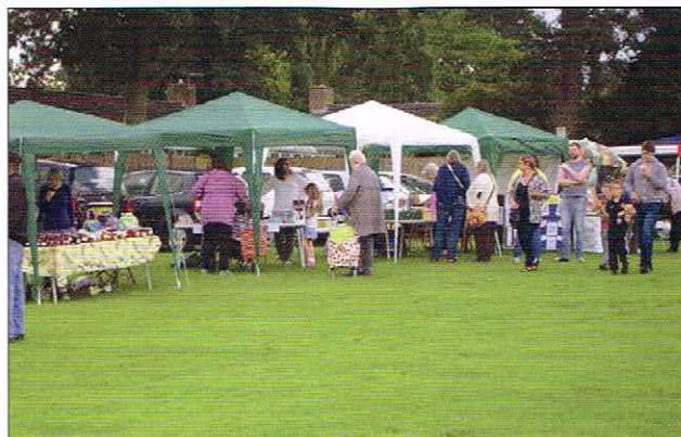
Stallholders enjoyed an afternoon of brisk business.