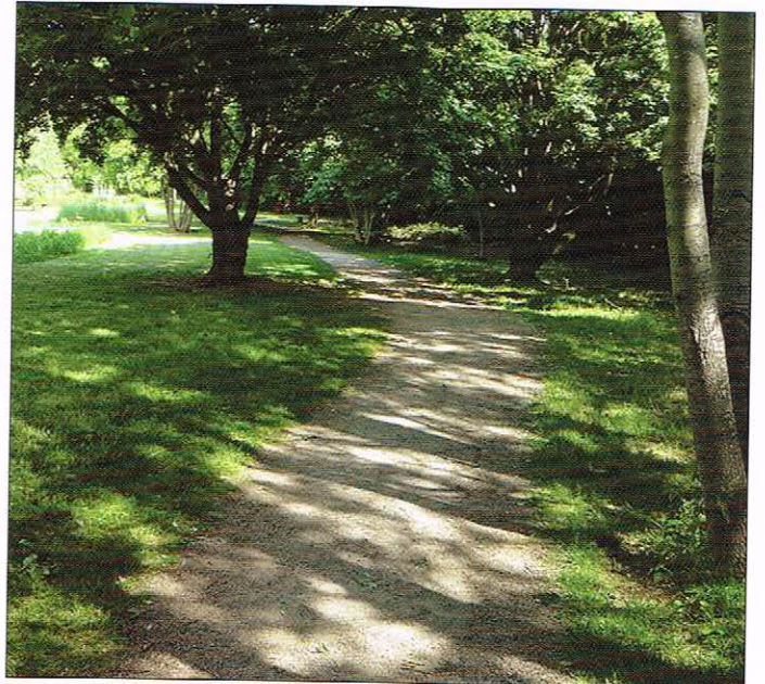
The 440-yard all-weather perimeter path attracts exercise users as well as leisure walkers.

finished project and maintained by a volunteer and the Parish Green Space Manager.