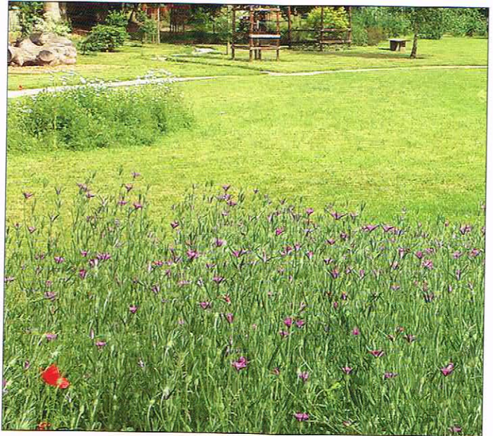
The Wild-flower Meadow has meandering paths crossing through it.

The Park has now been taken over by Billing Parish as an almost